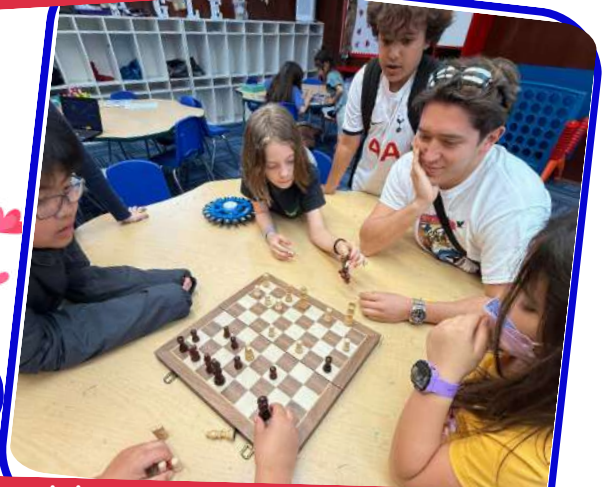
Sharpening cognitive skills and strategic thinking during a fun game of chess.