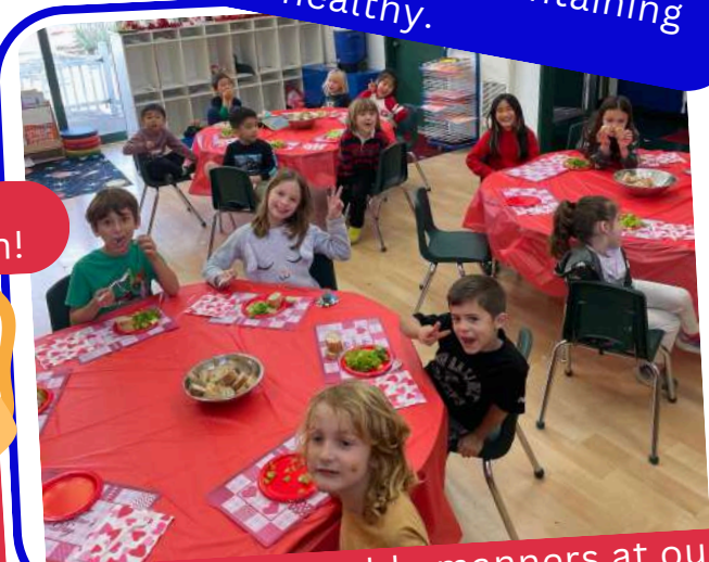
Having fun learning table manners at our three-course Valentine's Day lunch.