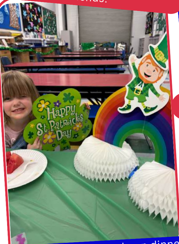
Enjoying a delicious leprechaun dinner during our St. Patty's party!