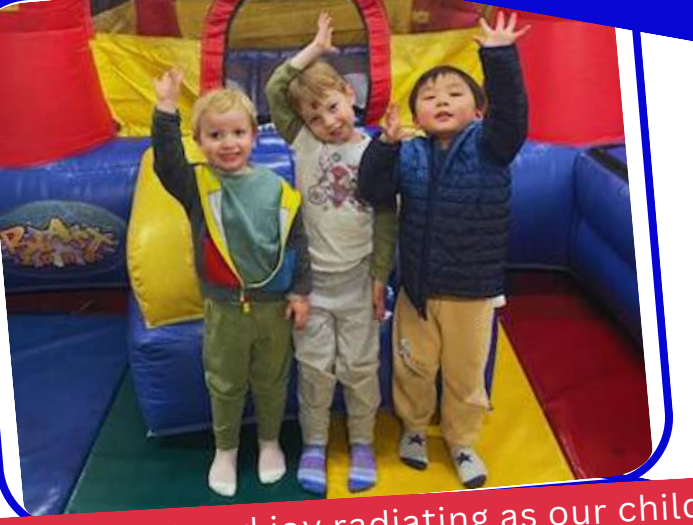
Excitement and joy radiating as our children get ready to jump in the bounce house!