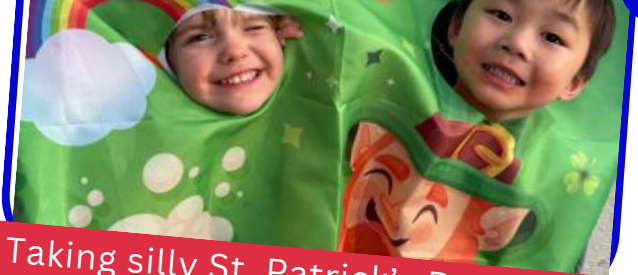
Taking silly St. Patrick's Day pictures with our new friends!