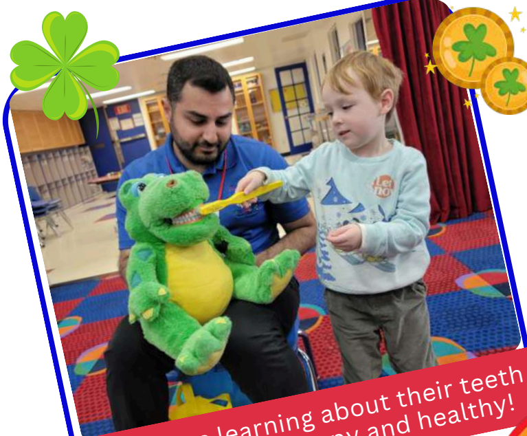
Our Preschoolers learning about their teeth and how to keep them happy and healthy!