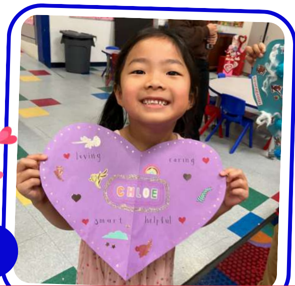
Loving, caring, smart, and helpful! Learning about self love through fun art projects.