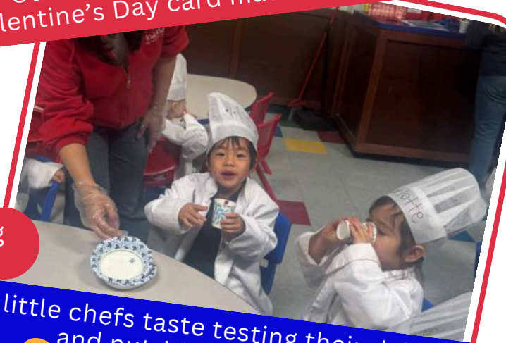
Our little chefs taste testing their delicious and nutritious creations!