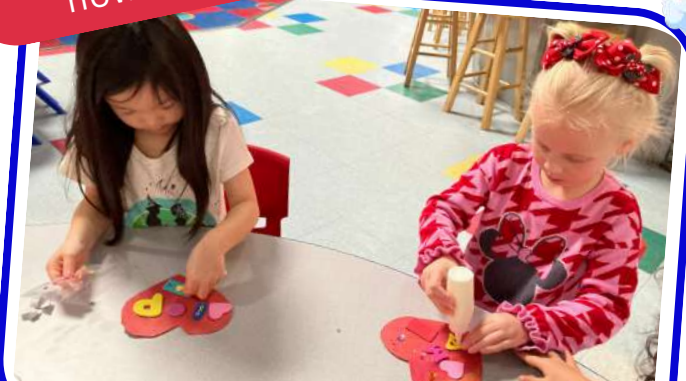
Working hard on Valentine's Day projects, using fine motor skills, and socializing with friends.