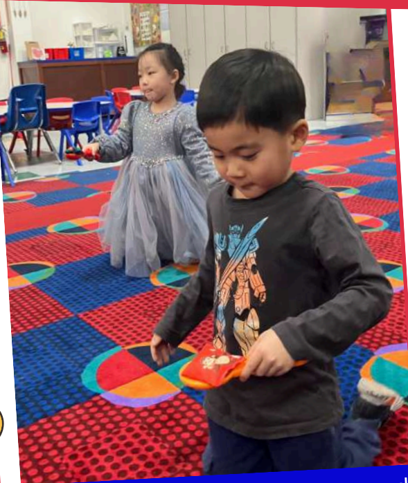
Preschoolers engaging their balance and coordination skills as they reach the finish line.