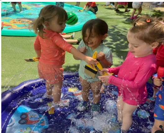
The Lady Bugs are fostering their social interaction skills with their peers during water play.