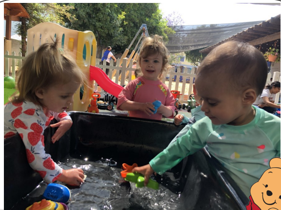
The Pooh Bears enjoyed exploring the water sensory table!