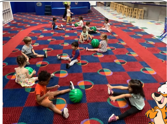
Our Tiggers had so much fun practicing Aim & Target while rolling watermelon balls to their Classmates.