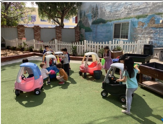
The Blue Whales are having some Car Wash fun and learning how to care for our toys.