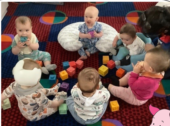
Our Piglets were fostering their curiosity while exploring different color blocks.

Kids Klub Pasadena ... Where Everyday Leads to a New Discovery!