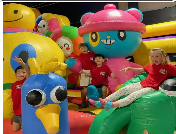
Field Trip Fun! Our Summer Camp children had so much fun at FunBox!